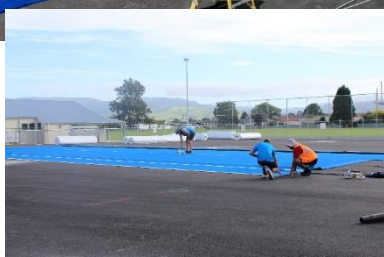
Update on court resurfacing progress