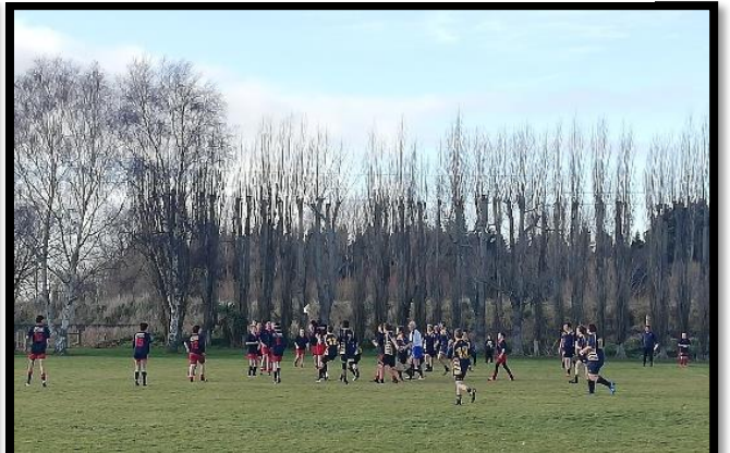
U14 Rugby Team