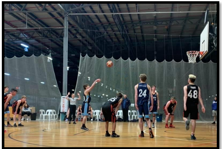
Senior Boys Basketball