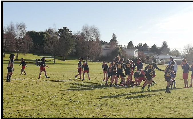
U15 Colts Rugby