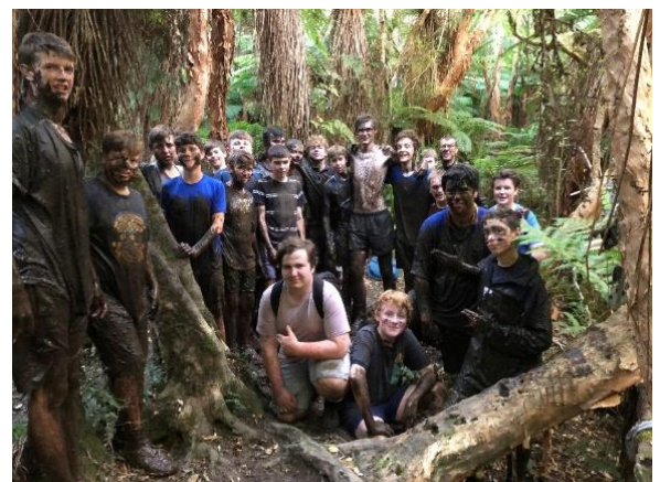
10TM/10PN Mud run Tautuku Camp