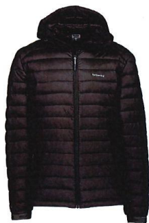
Torpedo7 Men's or Women's Resolve V4 Down Jacket