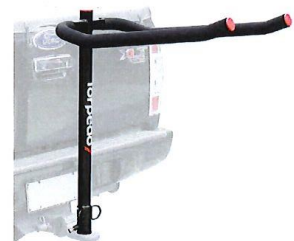
Torpedo7 4 Bike Rack Mk3