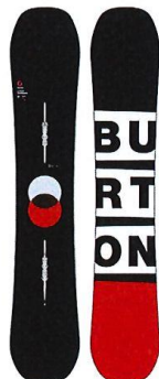
Burton 2020 Men's Custom Snowboard

More colours available online and in selected stores